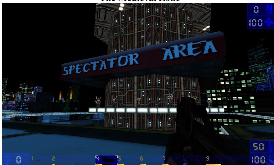
The Spectator Area