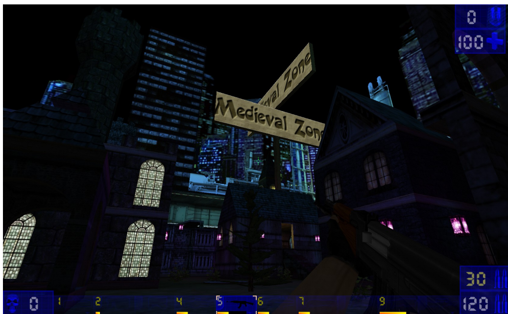
The Medieval Zone